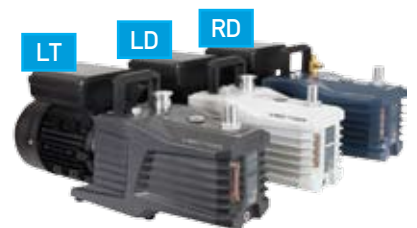
Vector LD and LT also available for laboratory applications

JAVAC products are available direct from our website and from a select range of Authorised Distributors. To order your Vector, visit www.javac.com.au or call us on 1300 786 771 .