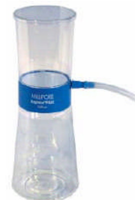
5 -15L flask